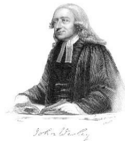
To Miss March 1775-7

Beware of indulging gloomy thoughts; they are the bane of thankfulness. You are encompassed with ten thousand mercies; let these sink you into humble thankfulness.