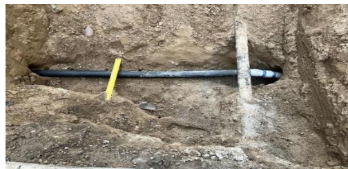
This is the new drain line going under the yellow gas line, abandon gas line and 2003 water line

New drain line connection to sewer main. Please note the connection is coated with concrete as extra insurance.