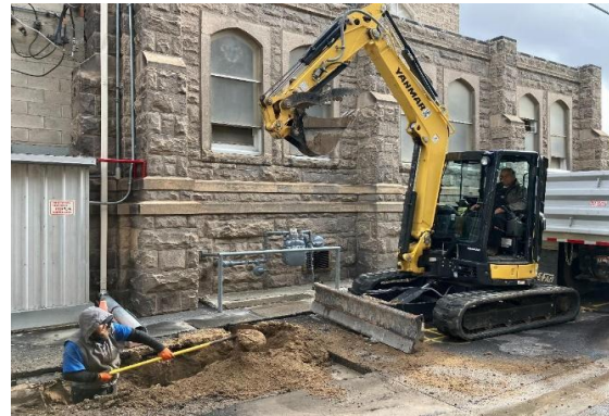
AAA Sewer hand digging in the alley behind Trinity.

The pavement in the alley has been repaired and everything is good as new.