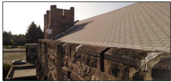
page 4 of 8