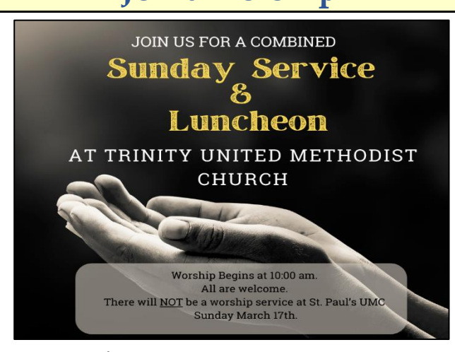
page 1 of 7